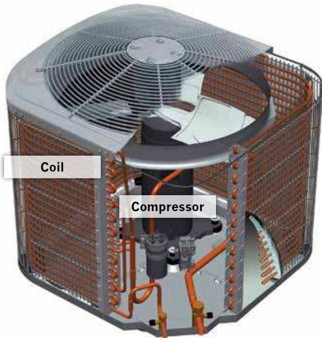
Comfort™ 16 Air Conditioner Shown

* Upon timely registration. The warranty period is five years if not registered within 90 days of installation. Wi-Fi® is a registered trademark of the Wi-Fi Alliance Corporation.